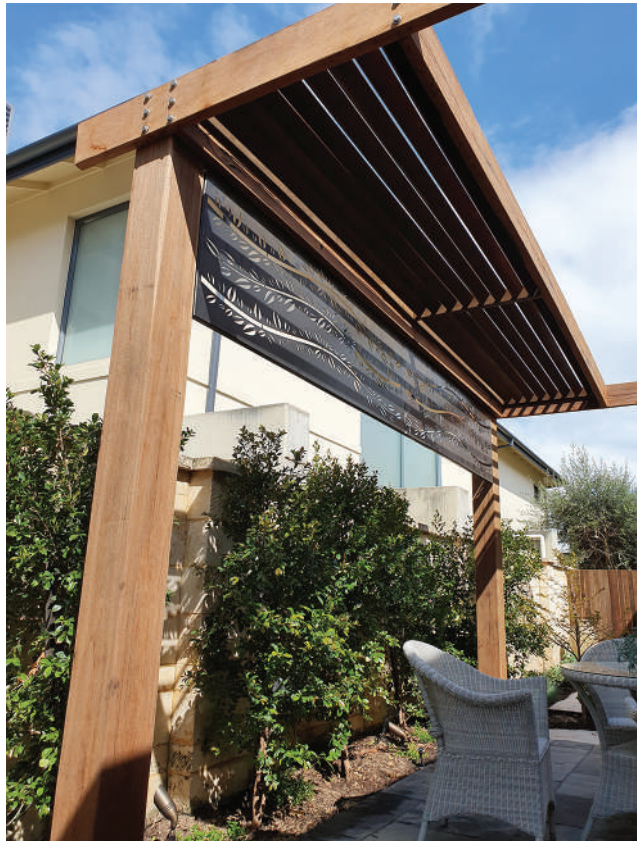
200x200 recycled Ironbark posts & privacy screen with a corten steel detailed infill.

In some cases the mill at Taree under its previous owner has supplied timber to these bridges decades ago. This continues its carbon storage and useful life into the future as we recycle these heritage timbers.