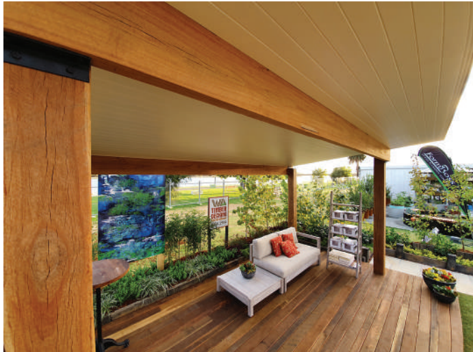
The Gold Medal Award Winning Display at the 2019 Perth Garden Festival.